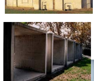
What does it mean?

** Peach group should prepare a pdf (under 2 MB) to be uploaded to server, and bring 2 color copies of each of the two handouts to each studio.